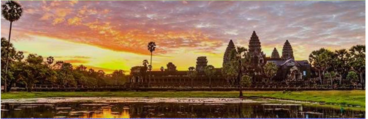
The Temple of Angkor Wat