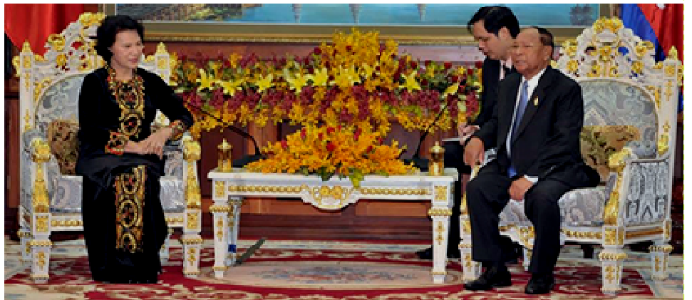
Bilateral meeting between Samdech Ponhea Chakrei Heng Samrin and H.E. Nguyen Thi Kim Ngan Vietnam's NA Chairwoman at the NA Palace, Phnom Penh

Legislative leaders of Cambodia and Vietnam have expressed their appreciation to the current bilateral relations and looked forward to further deepening their cooperation.